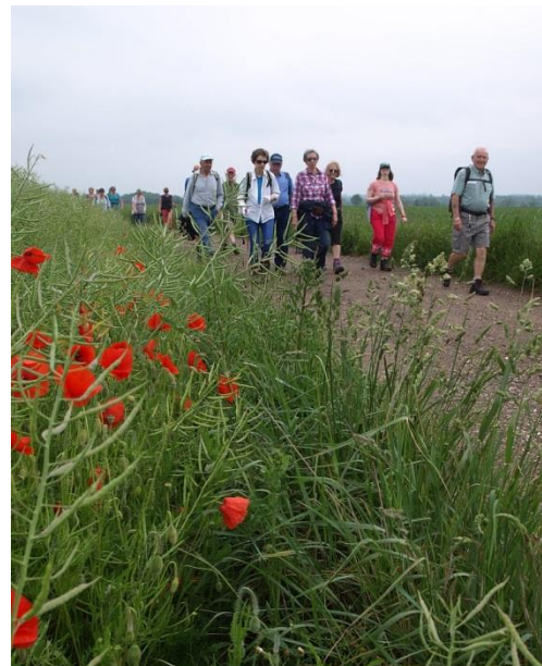
But there are unlikely to be poppies for us!